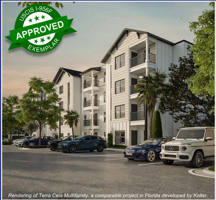
Rendering of Terra Ceia Multifamily, a comparable project in Florida developed by Kolter.